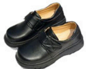
Boys Black shoes