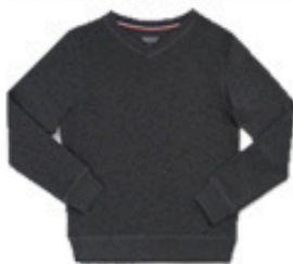
Rib Knit Pullover