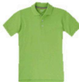
Short Sleeve Polo Lime Green