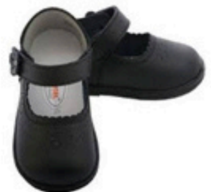
Girls Mary Jane black shoe