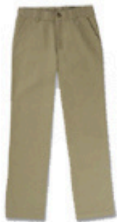
Straight Leg Khaki Pant