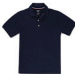
Short Sleeve Polo Navy